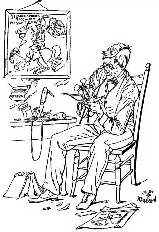
"HE WAS CONSTRUCTING WHAT SEEMED TO BE SOME KIND OF FRAIL MECHANICAL TOY."

was like to gaze and suffer till he died—you have seen that kind of pictures. Some of these terrors were land-scapes, some libeled the sea, some were ostensible portraits, all were crimes. All the portraits were recog-